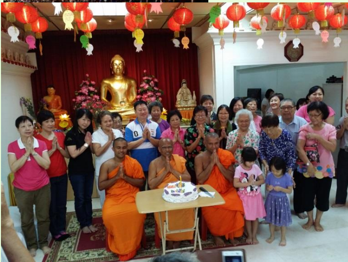
Mother's Day celebration in SBM