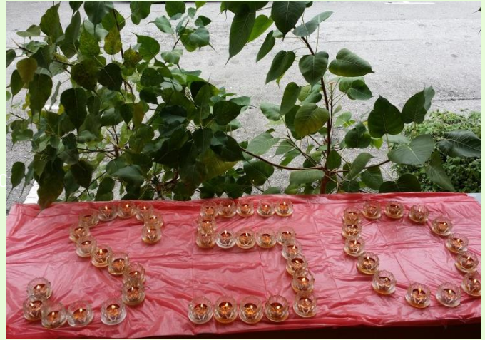
50 Candle-light brightly lite wishing Peace , Prosperity and Progress for Singapore in many years to come

Devotees and Venerables also share this merits in memory of late MM Lee Kuan Yew