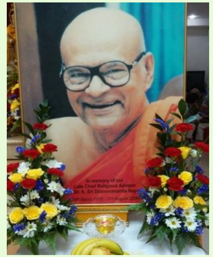
In Memory of our late Chief's 9 th Anniversary